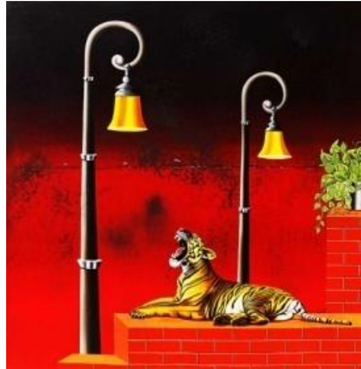
Roaring Acrylic on canvas 48" x 48" (122 x 122 cms) Rs. 2,00,000/-