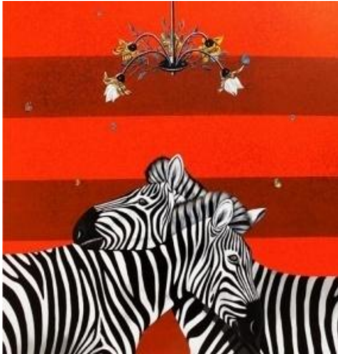
Love Acrylic on canvas 36" x 36" (91 x 91 cms) Rs. 1,00,000/-