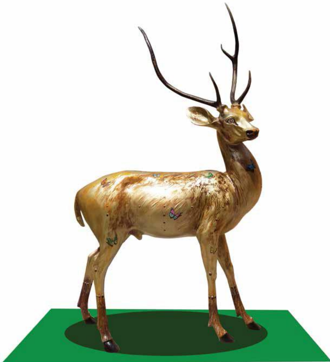
Welcome-I Fiberglass, auto paint, acrylic 74" x 43" x 16" (188 x 109 x 40 cms) Rs. 4,50,000/-