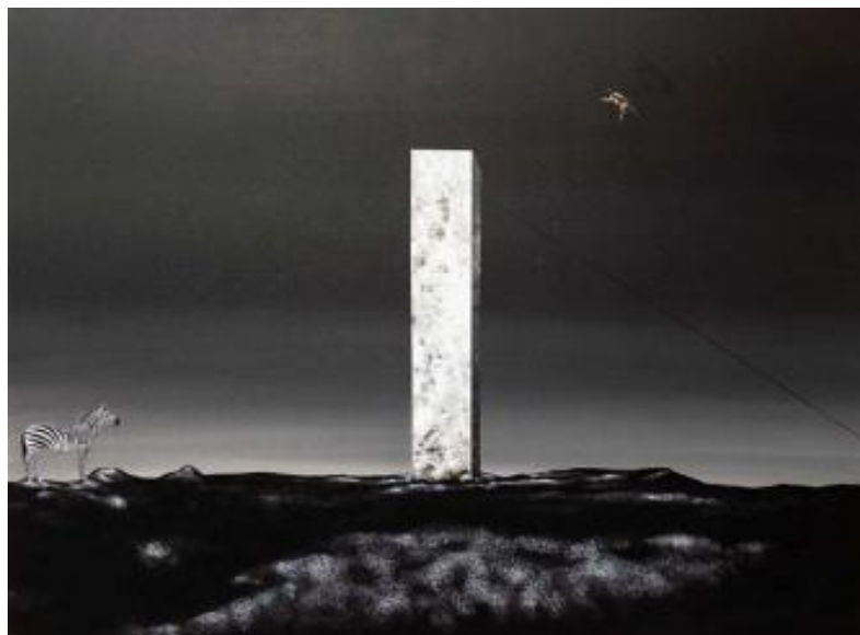
Landscape II Acrylic on canvas 48" x 60" (122 x 152 cms) Rs. 2,75,000/-