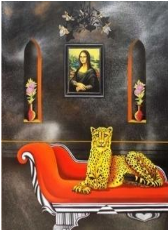
Royal Place III Mix media on canvas 60" x 48" (152 x 122 cms) Rs. 2,75,000/-