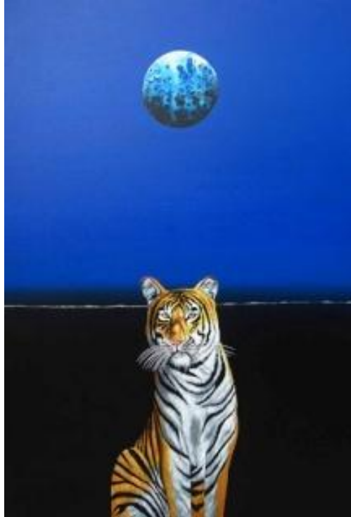
Blue Moon II Acrylic on canvas 34" x 48" (122 x 86 cms) Rs. 1,50,000/-