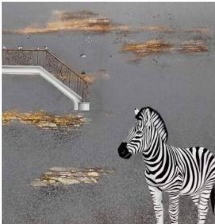
Extended Horizon Acrylic on canvas 48" x 48" (122 x 122 cms) Rs. 2,00,000/-