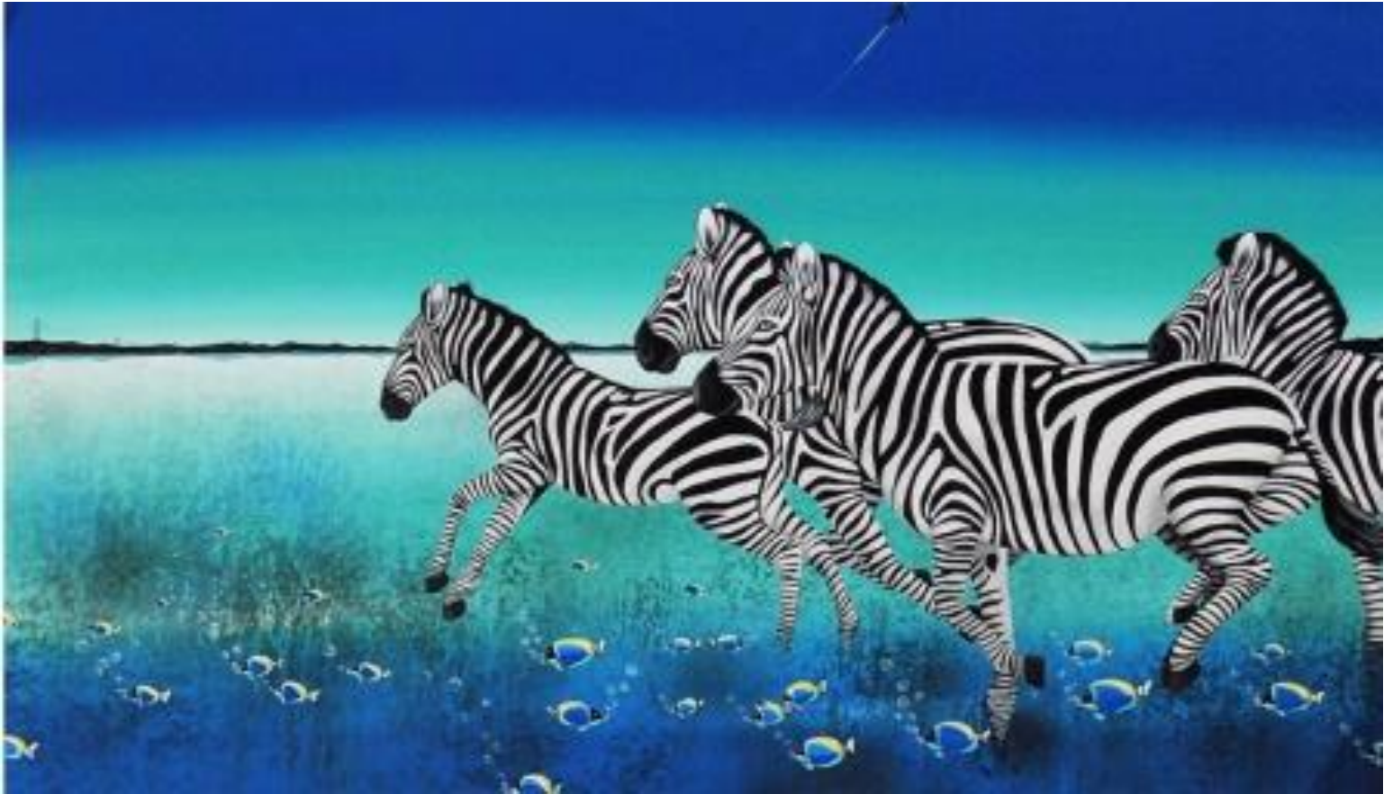
Runway -2016 Acrylic on canvas 36" x 60" (92 x 153 cms) Rs.2,25,000/-