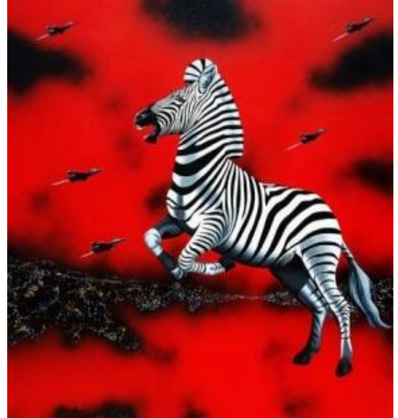
Flying Acrylic on canvas 48" x 48" (122 x 122 cms) Rs. 2,00,000/-