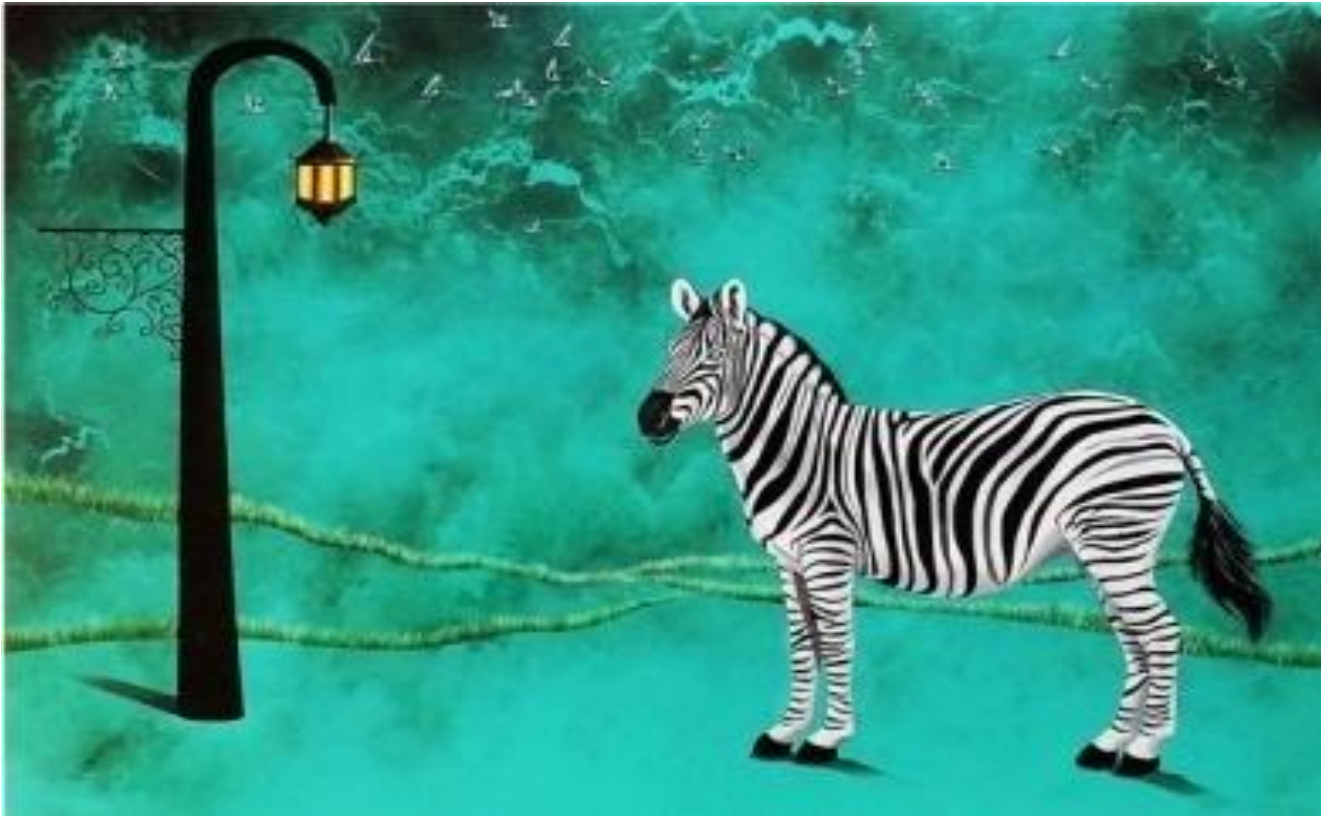
Mid Night Acrylic on canvas 48" x 72" (122 x 183 cms) Rs. 3,00,000/-