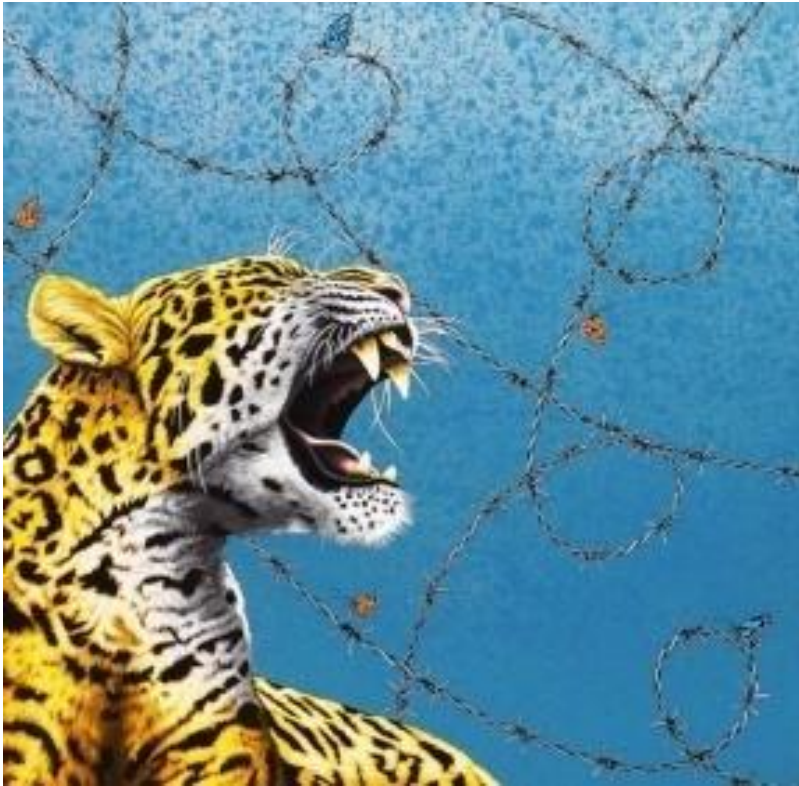
Cage Acrylic on canvas 36" x 36" (91 x 91 cms) Rs. 1,00,000/-