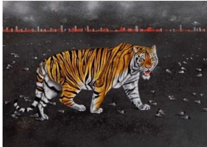
Landscape-III Acrylic on canvas 36" x 48" (91 x 122 cms) Rs. 1,50,000/-