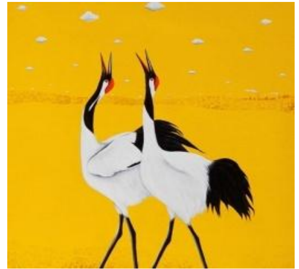
Awaiting Acrylic on canvas 36" x 36" (91 x 91 cms) Rs. 1,00,000/-