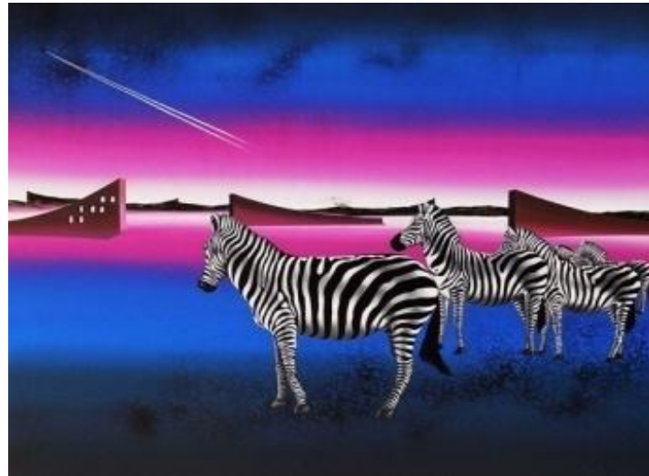
Encroachment Acrylic on canvas 48" x 60" (122 x 152 cms) Rs. 2,75,000/-