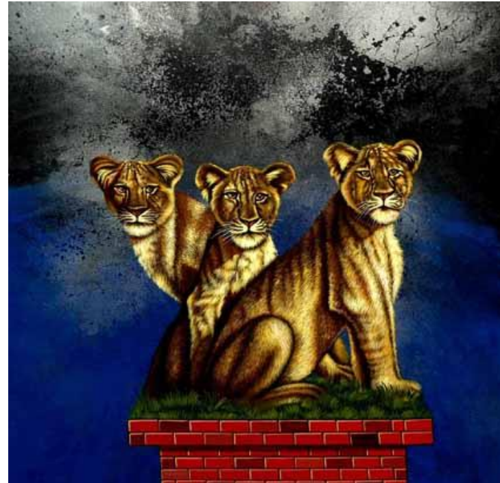
Untitled-1 Acrylic on canvas 36" x 36" (91 x 91 cms) Rs. 1,00,000/-