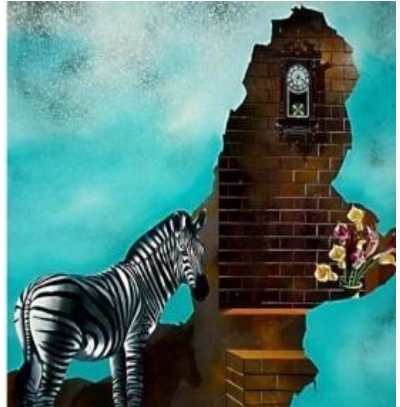
Vanishing Point Acrylic on canvas 54" x 54" (137 x 137 cms) Rs. 2,75,000/-