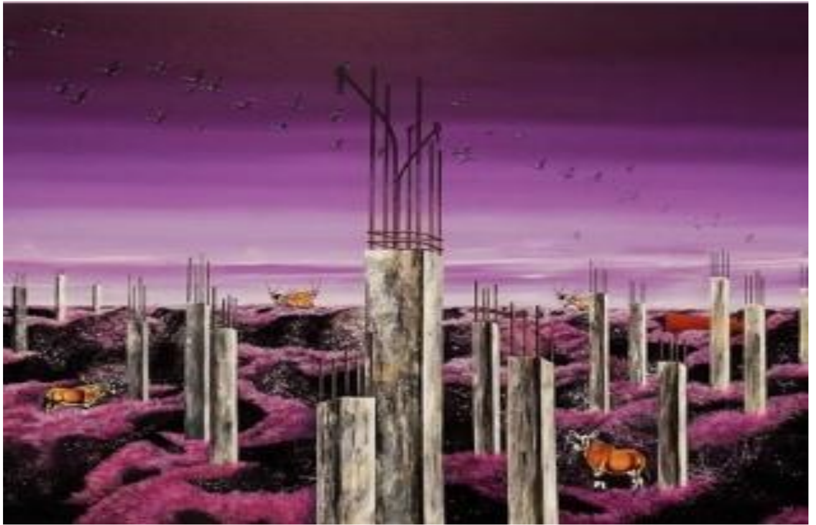
Story of Landscape IV Acrylic on canvas 72" x 84" (183 x 213 cms) Rs. 5,30,000/-