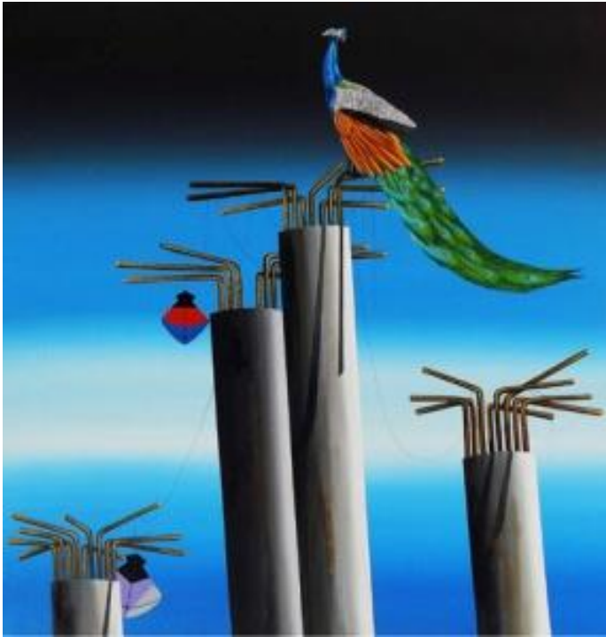
Iron Forest Acrylic on canvas 48" x 48" (122 x 122 cms) Rs. 2,00,000/-