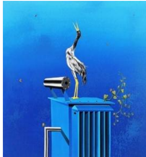
Wait for Rain Acrylic on canvas 36" x 36" (91 x 91 cms) Rs. 1,00,000/-