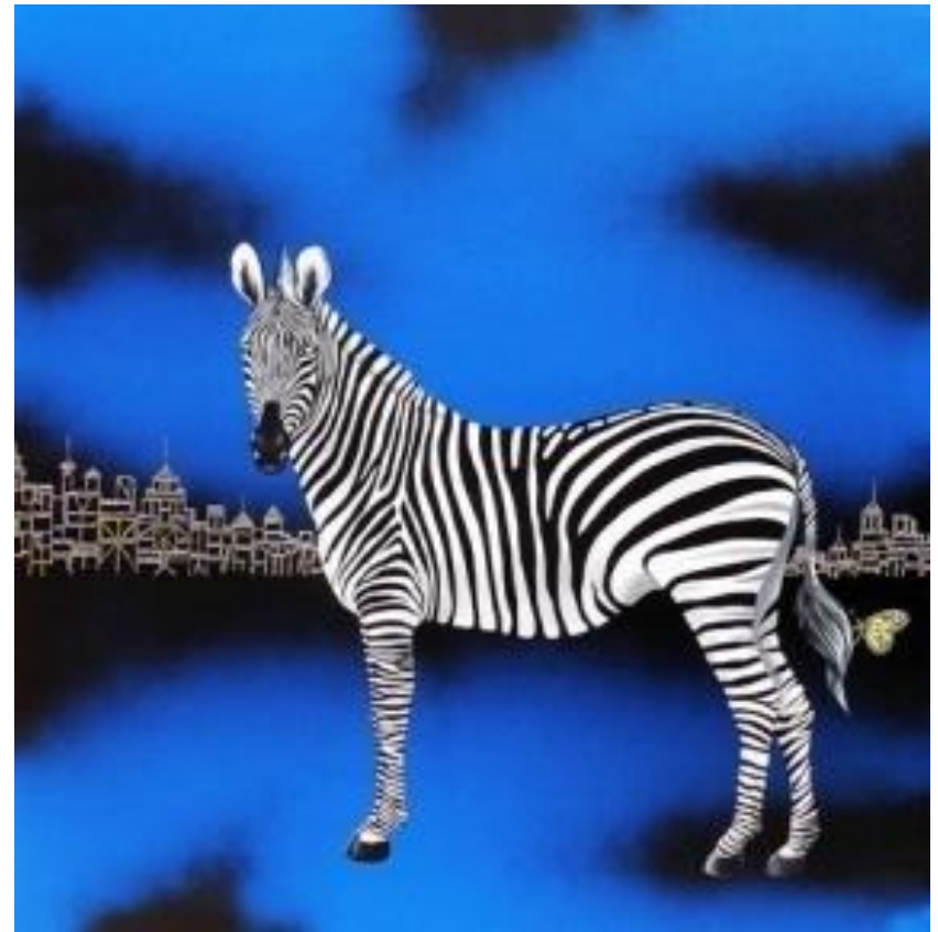
Untitled -II Acrylic on canvas 48" x 48" (122 x 122 cms) Rs. 2,00,000/-