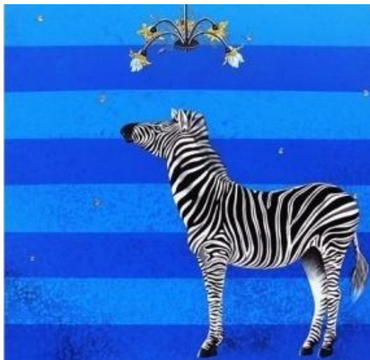
My New Place Acrylic on canvas 48" x 48" (122 x 122 cms) Rs. 2,00,000/-