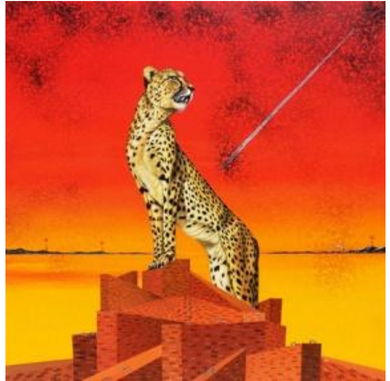
Top View Acrylic on canvas 48" x 48" (122 x 122 cms) Rs. 2,00,000/-