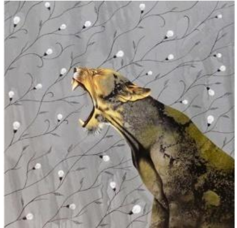
Roaring Acrylic on canvas 36" x 36" (91 x 91 cms) Rs. 1,00,000/-