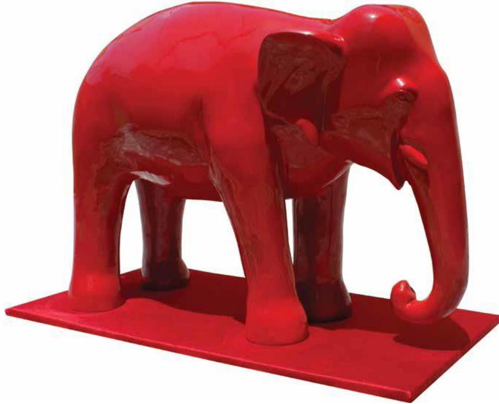
Welcome-II Fiberglass, auto paint, 33" x 14 x 19" (84 x 36 x 48 cms) Rs. 3,50,000/-