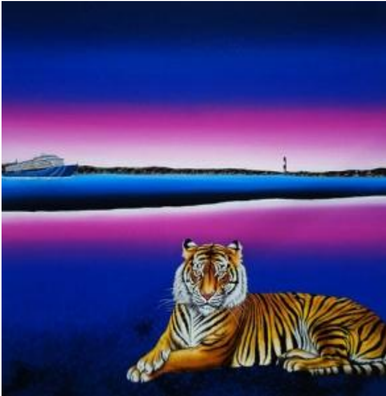
Where am I Acrylic on canvas 48" x 48" (122 x 122 cms) Rs. 2,00,000/-