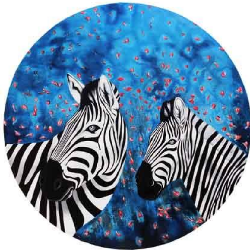
Untitled-1 Acrylic on canvas 36" x 36" (91 x 91 cms) Rs. 1,00,000/-