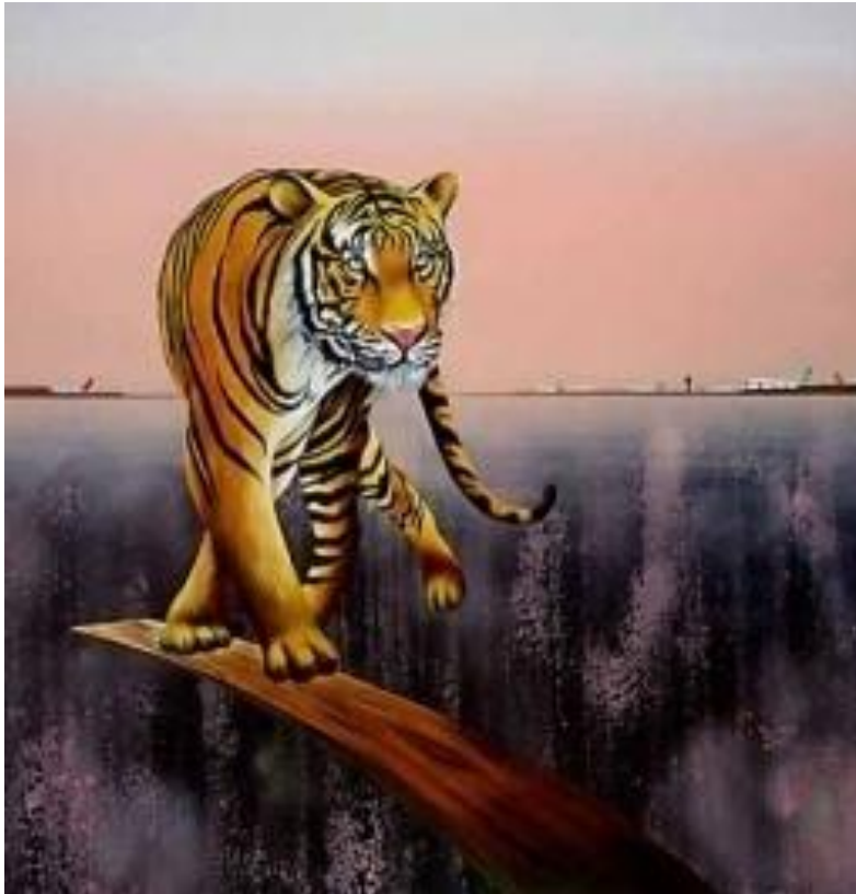
Jump-II Acrylic on canvas 54" x 54" (137 x 137 cms) Rs. 2,75,000/-