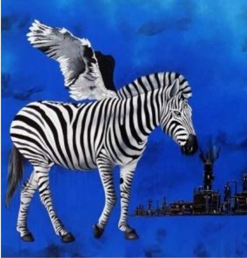
Ready to Fly-II Acrylic on canvas 48" x 48" (122 x 122 cms) Rs. 2,00,000/-