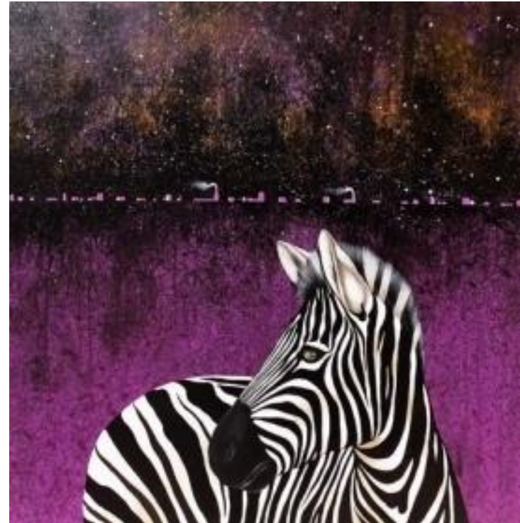
Untitled Acrylic on canvas 36" x 36" (91 x 91 cms) Rs. 1,00,000/-