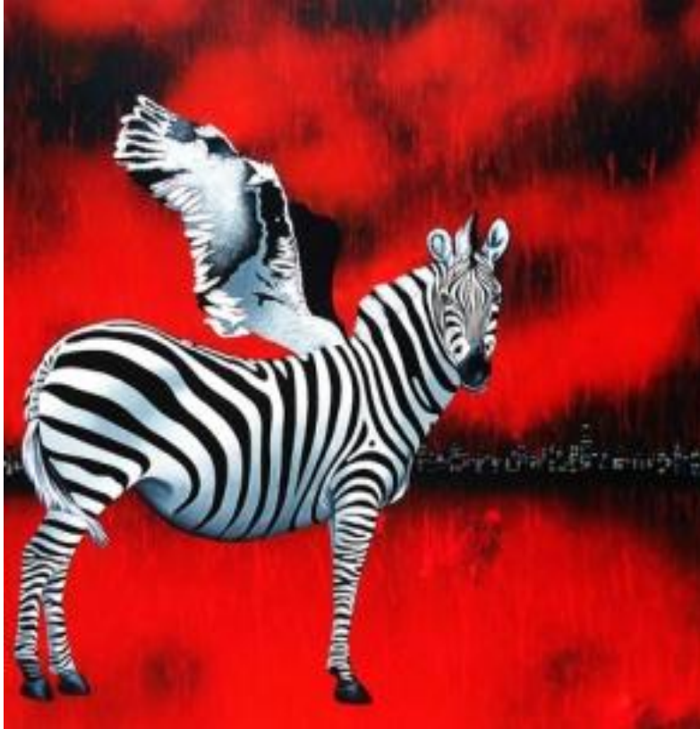
Ready to Fly III Acrylic on canvas 48" x 48" (122 x 122 cms) Rs. 2,00,000/-