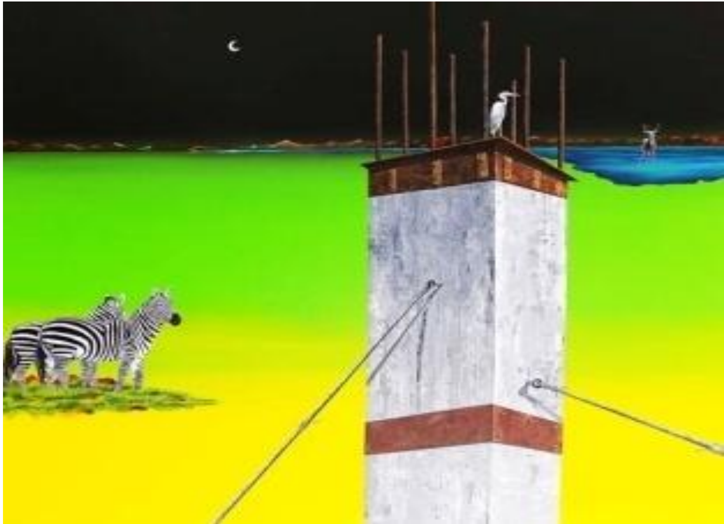
Story of Landscape - I Acrylic on canvas 72" x 84" (183 x 213 cms) Rs. 5,30,000/-