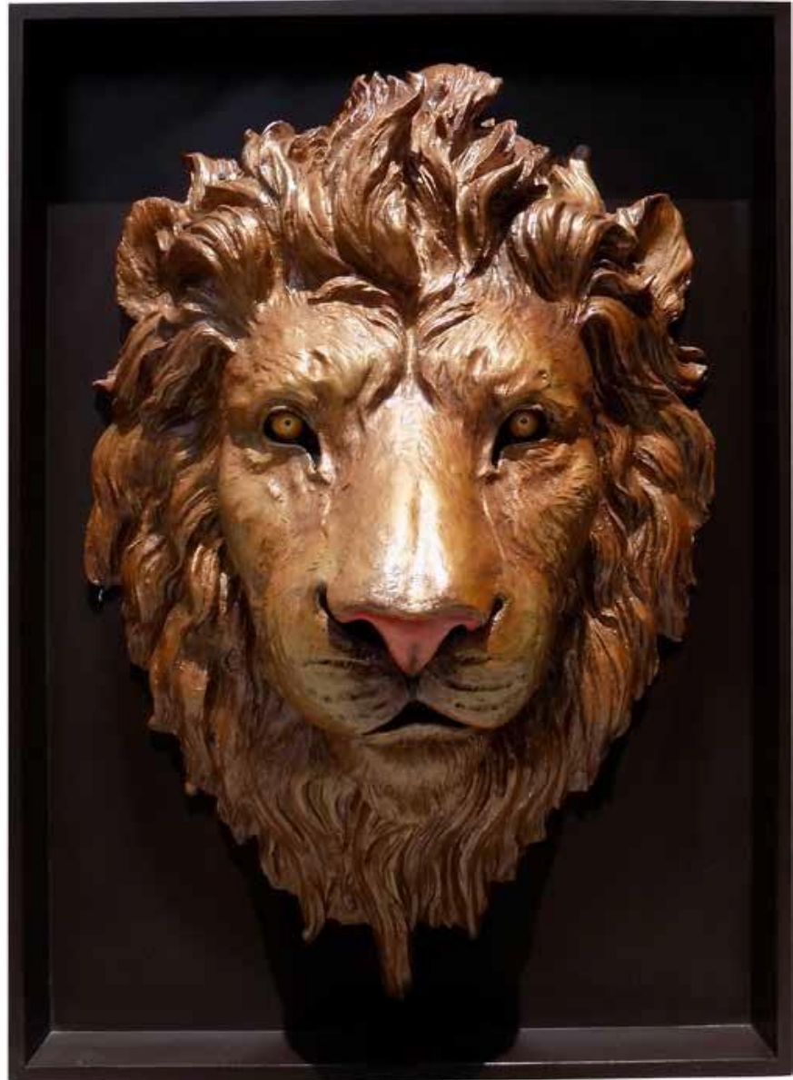
Welcome-III Fiberglass, auto paint, wood, acrylic 28" x 16" x 39" (71 x 41 x 99 cms) Rs. 2,80,000/-