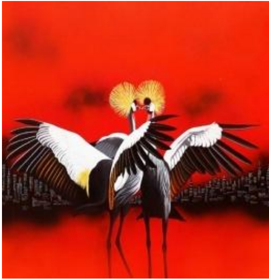
Dancing Crane Acrylic on canvas 36" x 36" (91 x 91 cms) Rs. 1,00,000/-